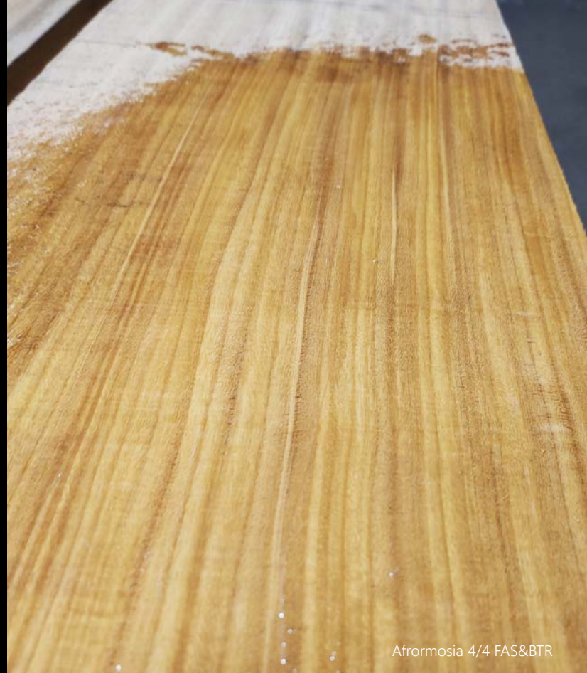
Afrormosia 4/4 FAS&BTR