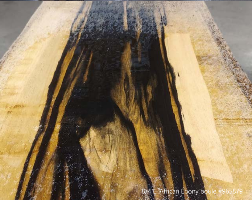
8/4 E. African Ebony boule #965879