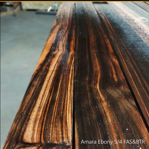
Amara Ebony 5/4 FAS&BTR

Range of Lengths | 9'-10' • Range of Widths | 22"-31.5" • Range of Thicknesses | 2.5"-4"+