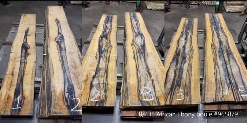
8/4 E. African Ebony boule #965879