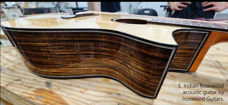
E. Indian Rosewood acoustic guitar by Ironwood Guitars.

Our inventory: FAS&BTR | 8/4, 16/4 | Boule | 12/4 Finished Slabs | Ranging 2-5' long