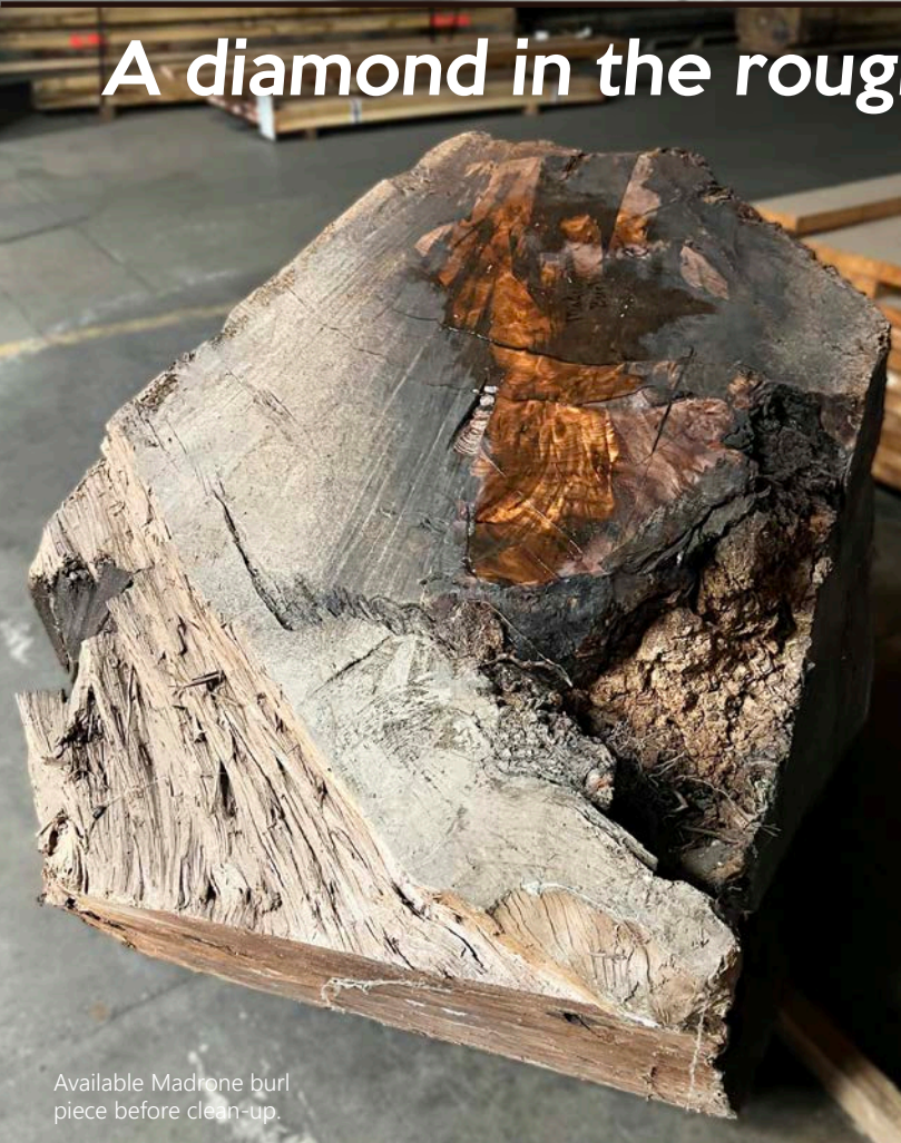
Available Madrone burl piece before clean-up.