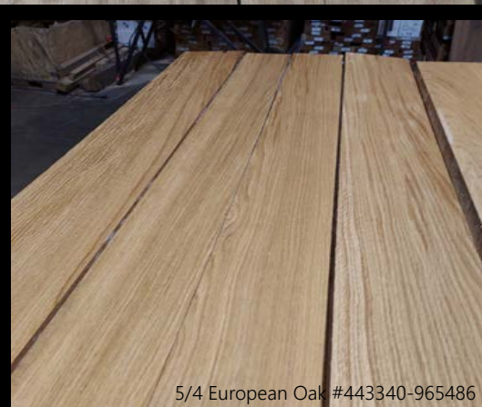
5/4 European Oak #443340-965486