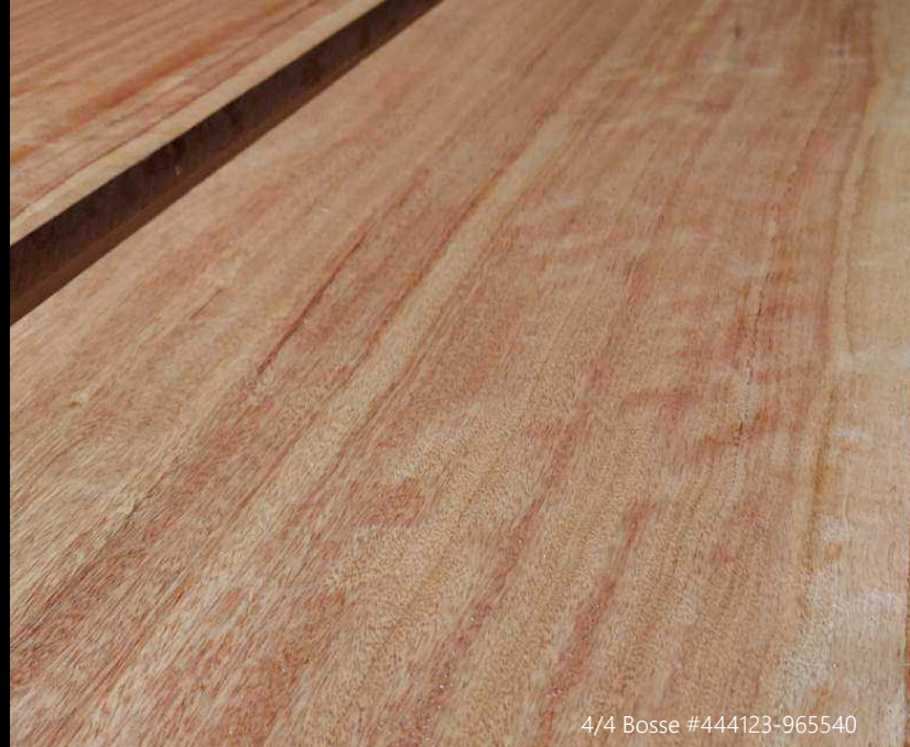
4/4 Bosse #444123-965540