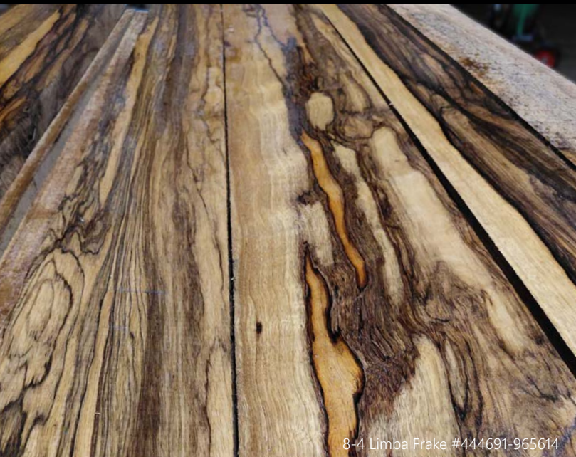
8-4 Limba Frake #444691-965614