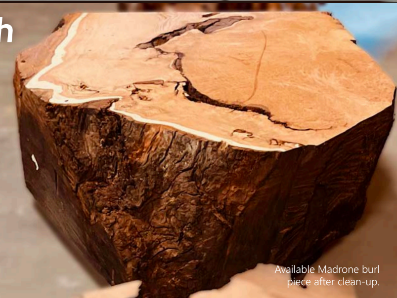
Available Madrone burl piece after clean-up.

Madrone burl offers exceptional figure and stability, prized by guitar builders, fine furniture makers, and artisans. Pictured above are guitar tops from Bridge Builder Guitars that highlight this wood's stunning, natural beauty. The piece pictured below is available now, along with many other unique finds from M. Bohlke Lumber. Reach out to your MB Sales Rep or contact us today to make it part of your next masterpiece.