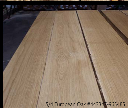
5/4 European Oak #443347-965485