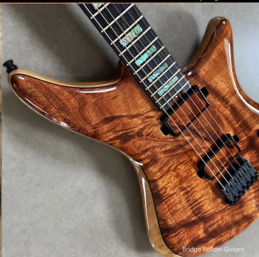
Bridge Builder Guitars