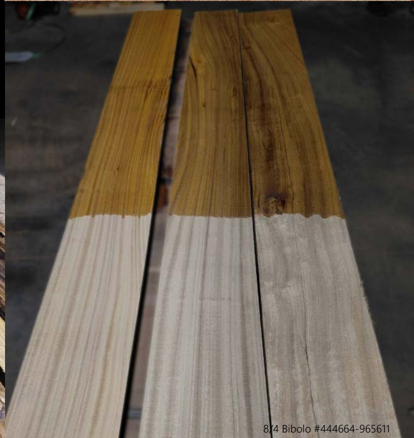
8/4 Bibolo #444664-965611