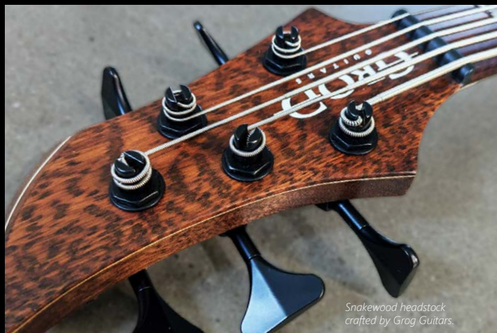
Snakewood headstock crafted by Grog Guitars.

Snakewood Fingerboards: 69.85mm X 9.525mm X 508mm 76.2mm X 9.525mm X 685.8mm