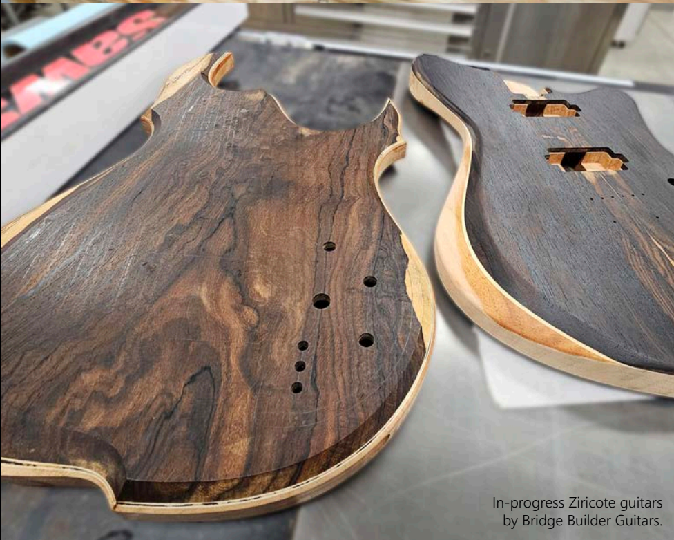
In-progress Ziricote guitars by Bridge Builder Guitars.