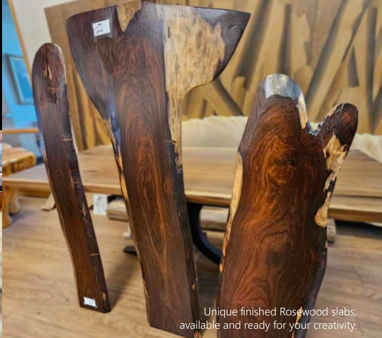
Unique finished Rosewood slabs, available and ready for your creativity.