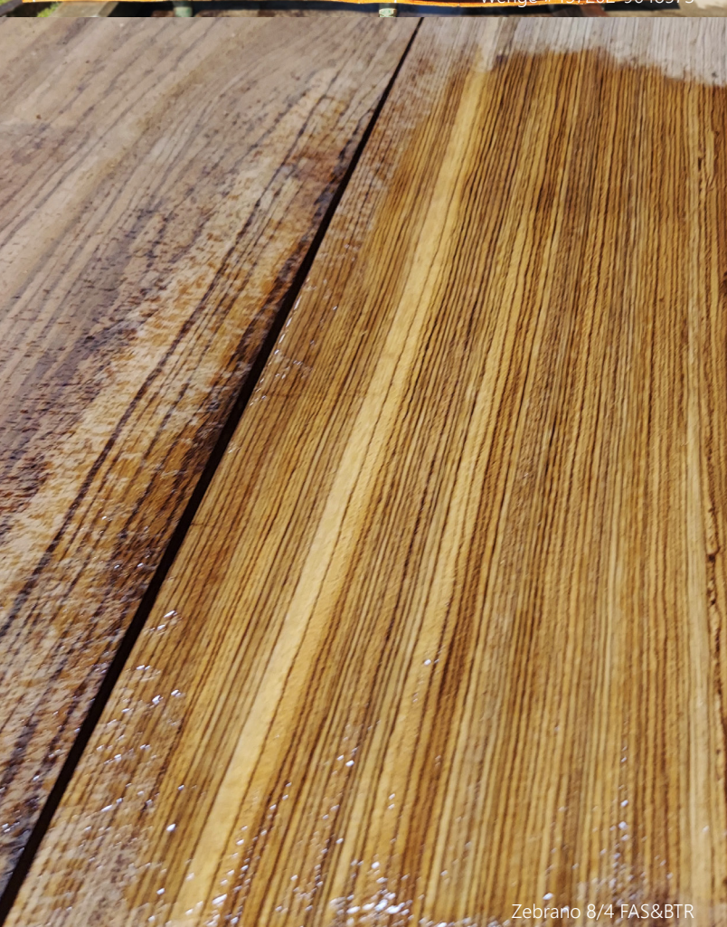
Zebrano 8/4 FAS&BTR