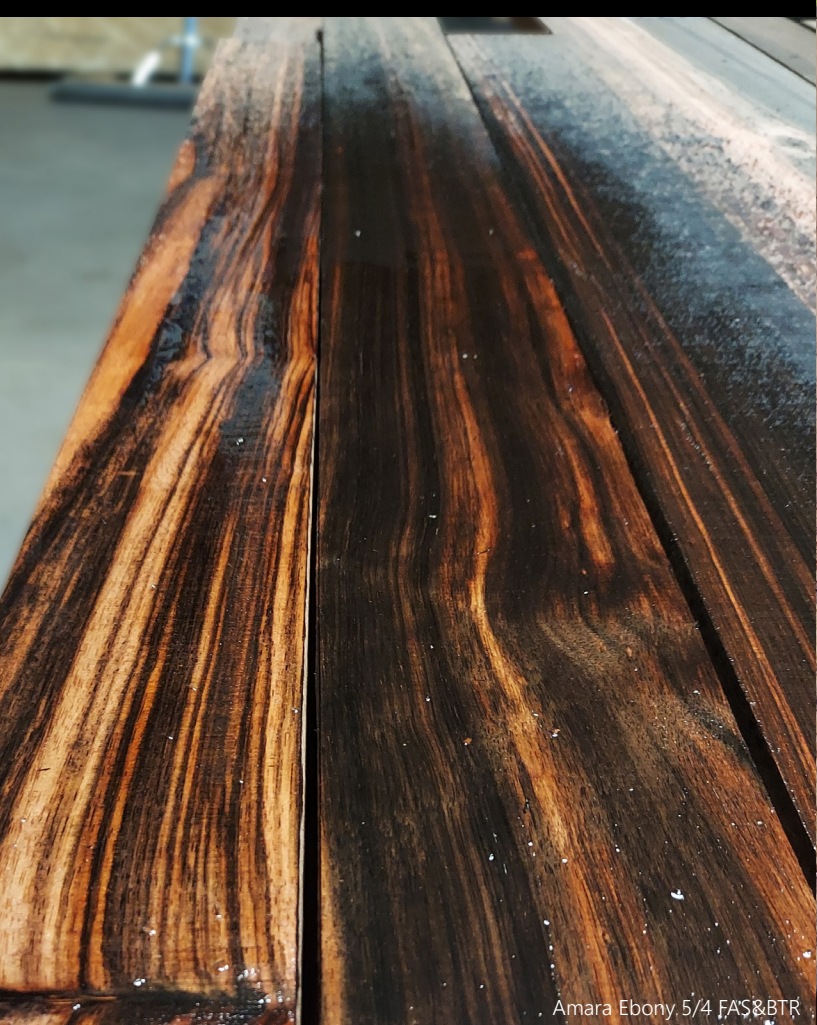
Amara Ebony 5/4 FAS&BTR