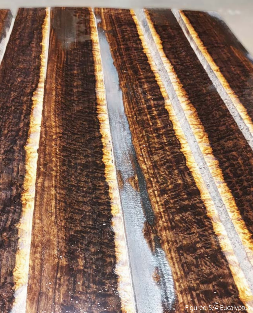
Figured 5/4 Eucalyptus