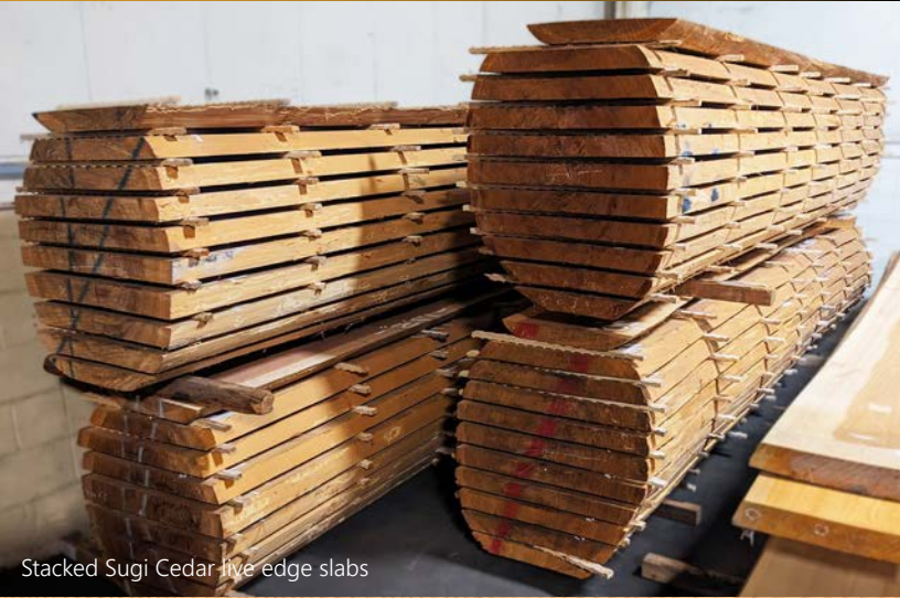
Stacked Sugi Cedar live edge slabs

Lightweight yet strong, Sugi Cedar is ideal for indoor and outdoor applications, bespoke furniture, elegant paneling, and distinctive design elements.