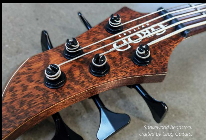
Snakewood headstock crafted by Grog Guitars.

Snakewood Fingerboards: 69.85mm X 9.525mm X 508mm 76.2mm X 9.525mm X 685.8mm