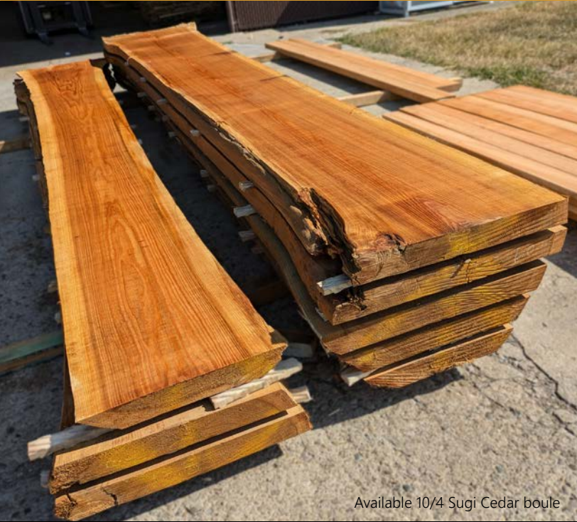
Available 10/4 Sugi Cedar boule

Also available as flat cut and quarter cut veneer