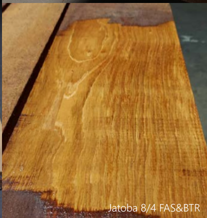
Jatoba 8/4 FAS&BTR