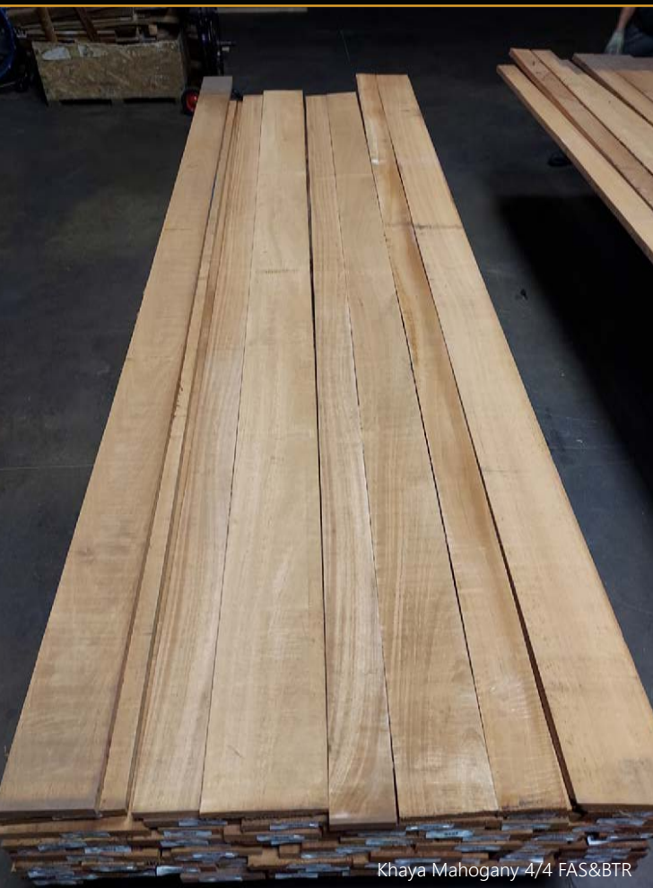
Khaya Mahogany 4/4 FAS&BTR