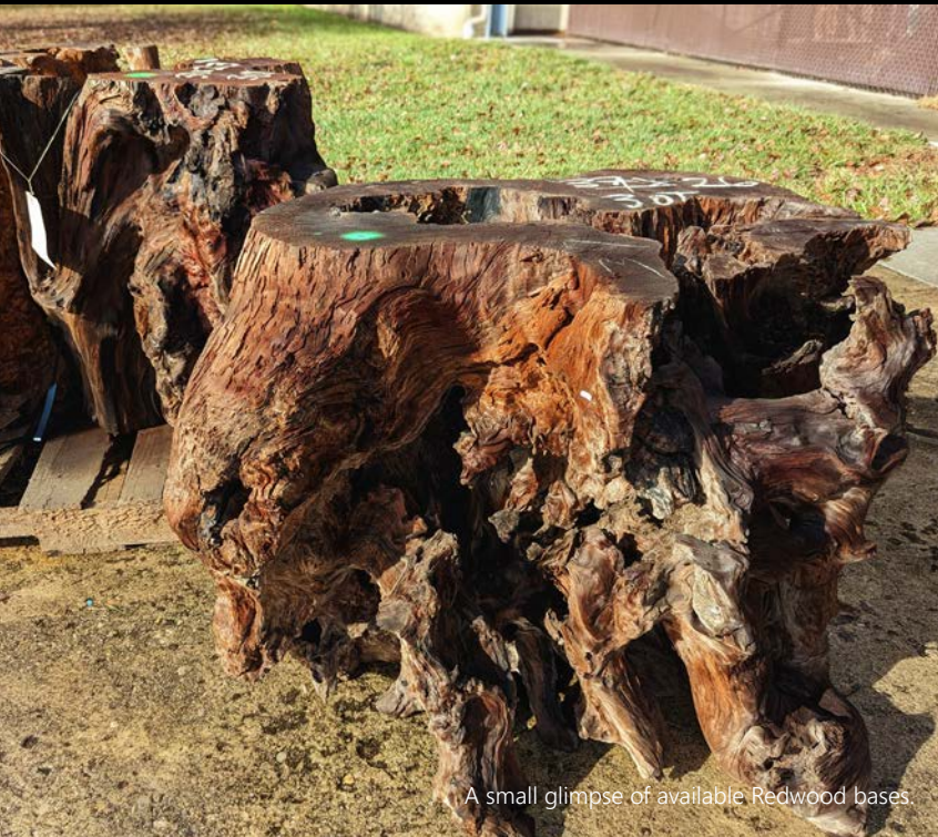
A small glimpse of available Redwood bases.

Sustainably using one of Earth's most beautiful resources to enrich the world around us.