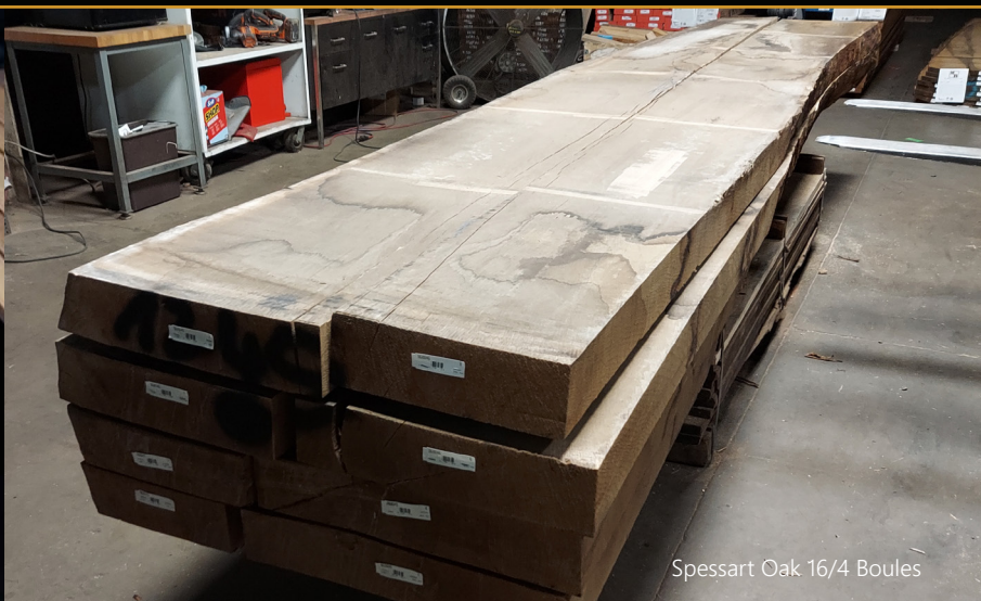
Spessart Oak 16/4 Boules