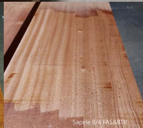
Sapele 8/4 FAS&BTR