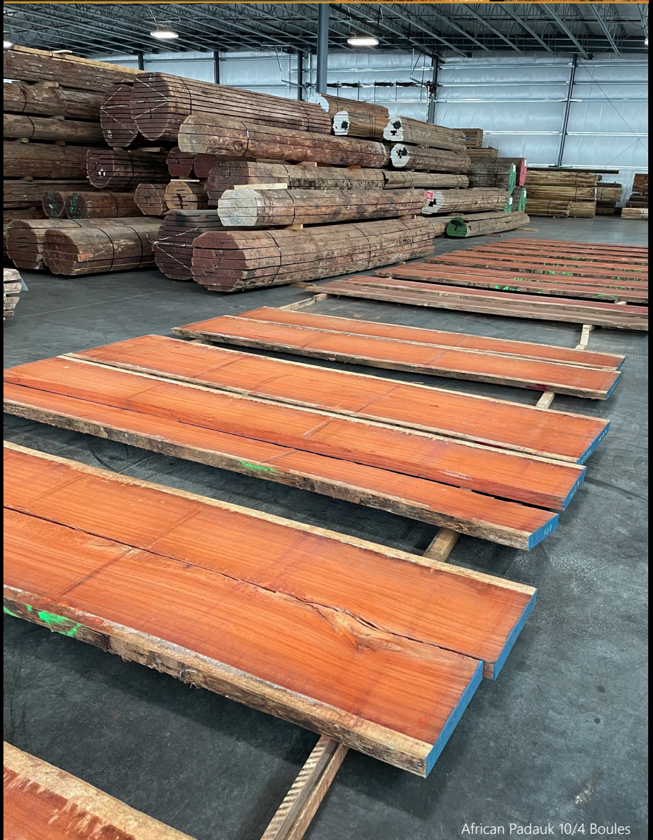
African Padauk 10/4 Boules