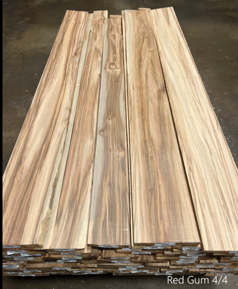
Red Gum 4/4