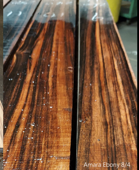
Amara Ebony 8/4