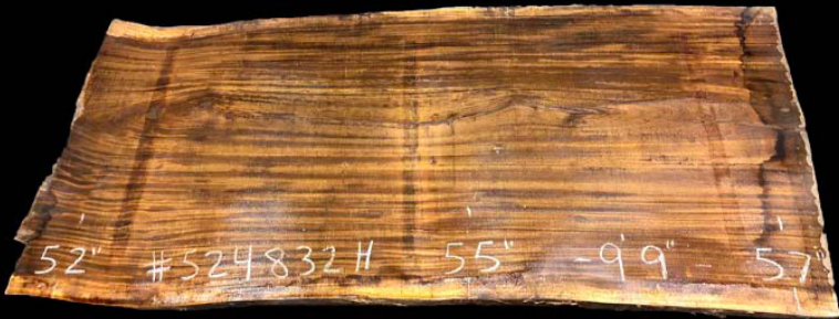
#406040-524832H - 9.71' long x 53.94" wide x 2.76" deep