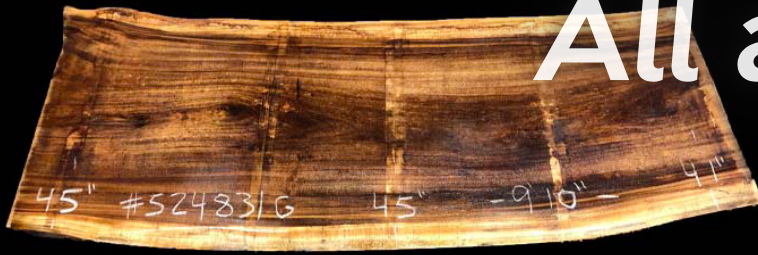
#405790-524831G - 9.84' long x 42.91" wide x 2.56" deep