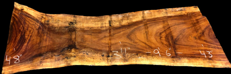
#406040-524832R - 9.51' long x 40.94" wide x 2.68" deep

Native to South America, Parota slabs take the spotlight this summer. Like many other woods, Parota has different names depending on the region—Huanacastle, also spelled Guanacaste, being the most common other name.